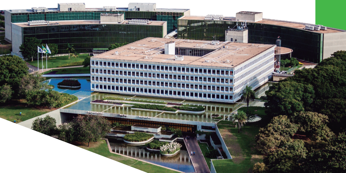
Brazilian Federal Court of Accounts (TCU)